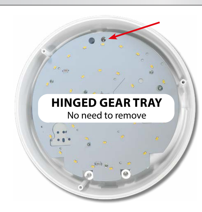
STEP 2 Loosen single gear tray screw