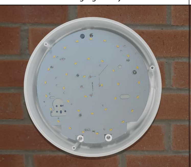
STEP 5 Fix and secure gear tray in place