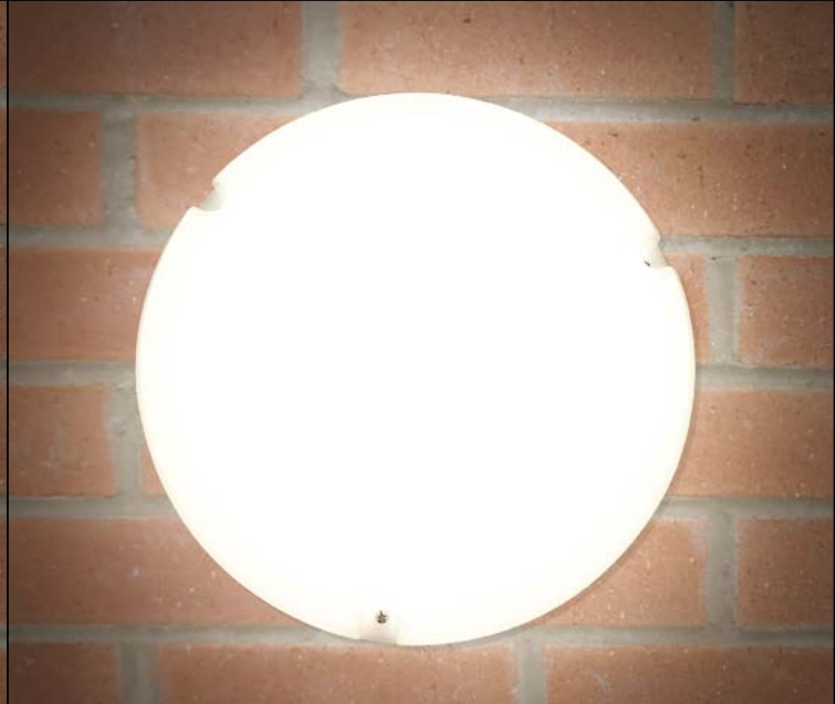
STEP 6 Secure diffuser in place