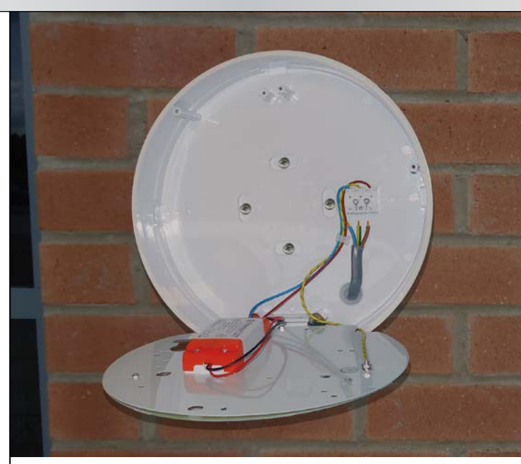
STEP 3 Fix base to mounting surface