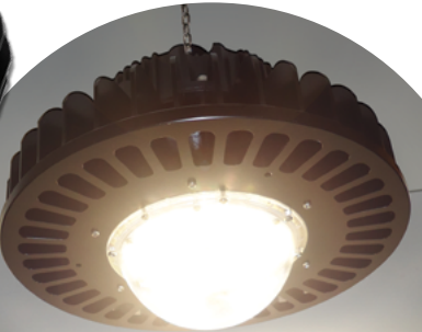
HBAYLEDCIR (no reflector)