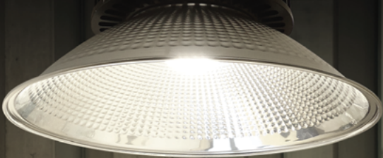
HBAYLEDCIR & HBDIFALU90