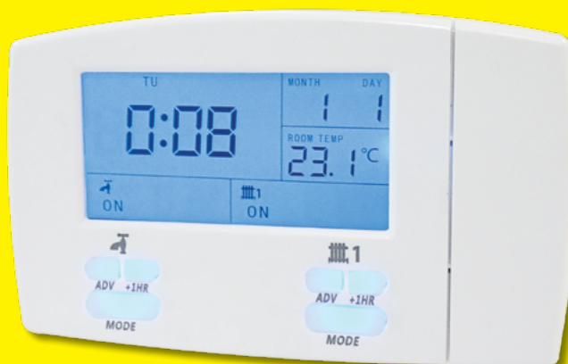
Dual Channel Heating Controller CODE: ONPR2

For control of multi zone heating and hot water control independently