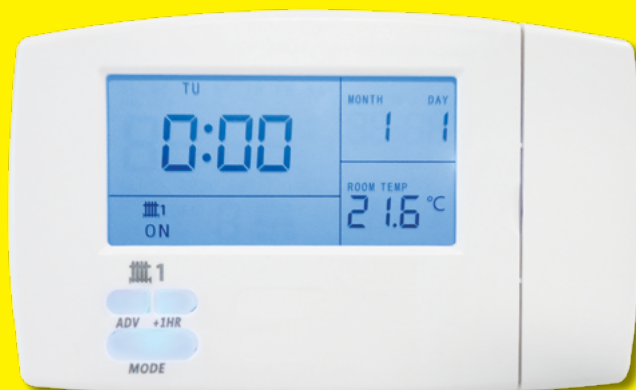
Single Channel Heating Controller CODE: ONPR1

For control of both heating and hot water control independently