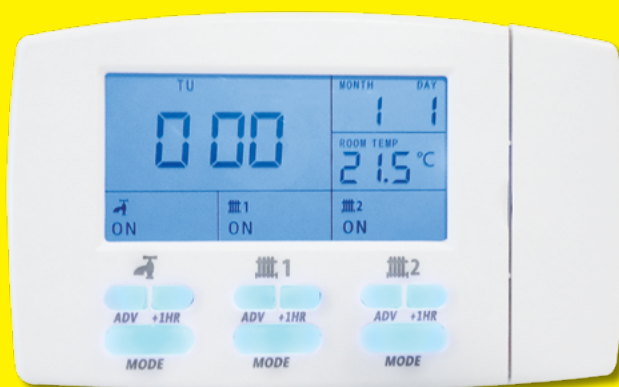
Three Channel Heating Controller CODE: ONPR3

For control of multi zone heating and hot water control independently