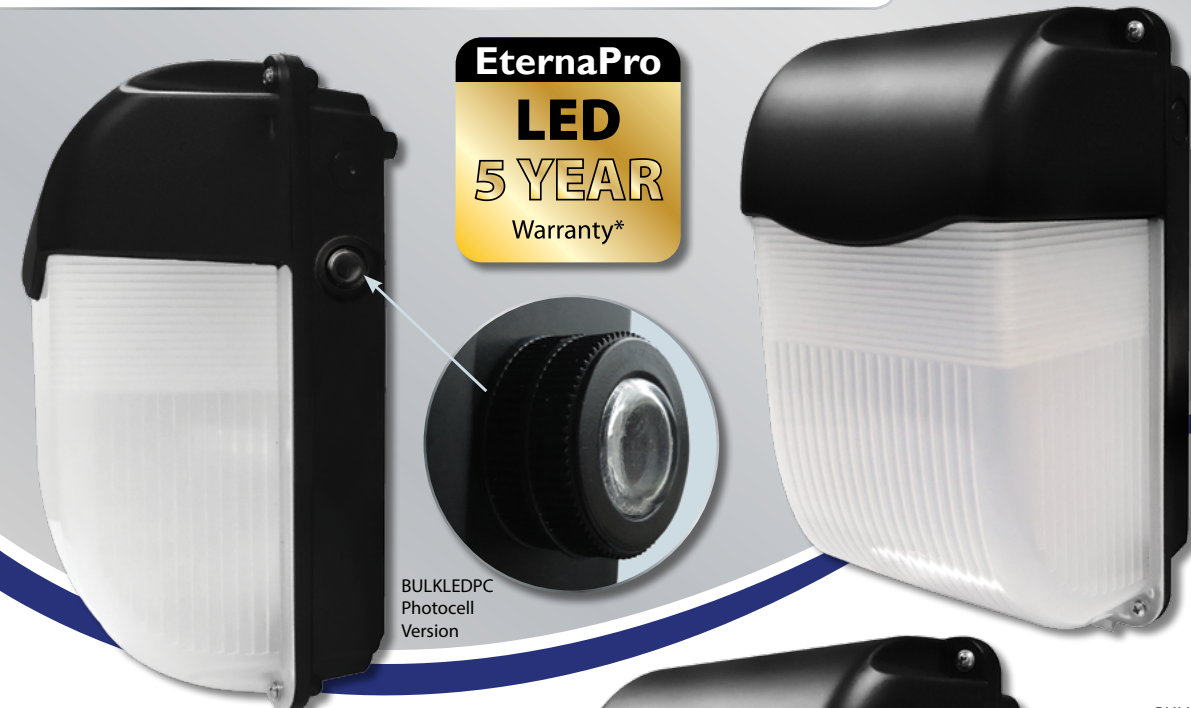
BULKLEDPC Photocell Version