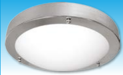
PACIFIC12 IP44 Ceiling Light ZONE 1