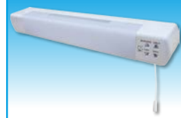
LED SHDVO IP20 S15 LED Lamp ZONE 3