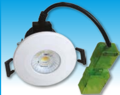
IFIRELCSWH IP65 Fire Rated Downlight ZONE 1