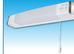
LED SH44 IP44 LED Array ZONE 3