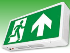
LED Maintained Emergency Exit Box Sign Viewing Distance - 29m-33m