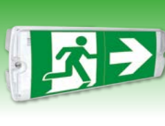
LED Maintained Emergency Bulkhead Viewing Distance - 20m