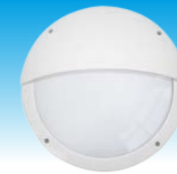
LED Aluminium Emergency Wall Light