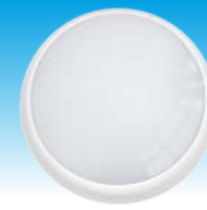
LED Emergency Carina Ceiling/Wall Light