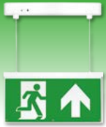
LED Emergency Hanging Exit Sign Light Viewing Distance - 29-30m