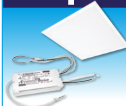
LED Panel + Emergency Battery Pack