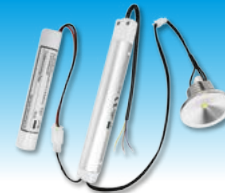
LED Non-maintained Emergency Downlight