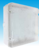
LED Emergency Square Prismatic Utility Light