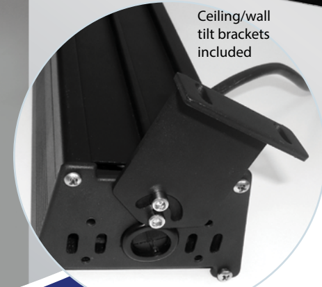
Ceiling/wall tilt brackets included