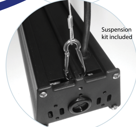
Suspension kit included