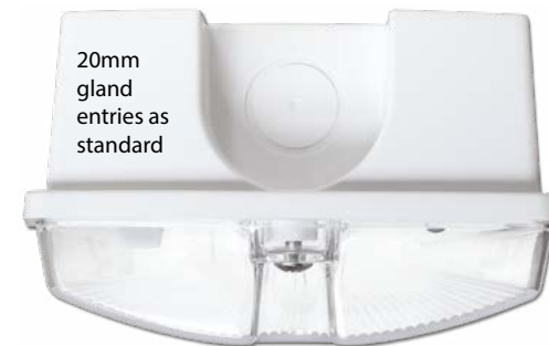
20mm gland entries as standard