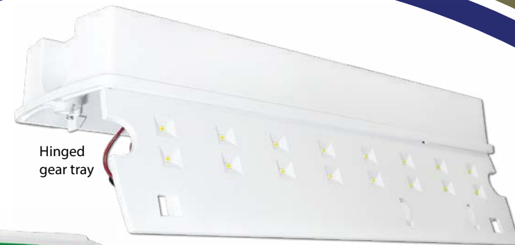
Hinged gear tray