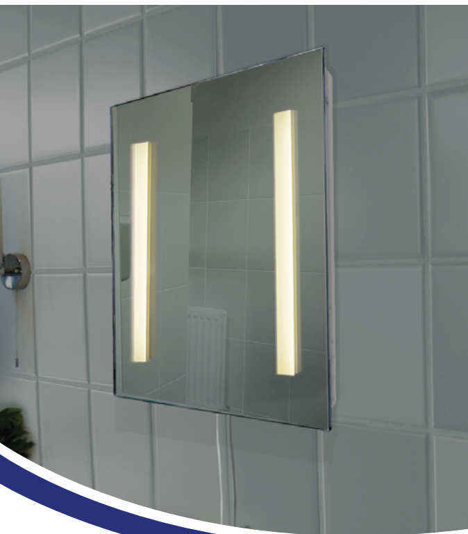
Night view of illuminated strip